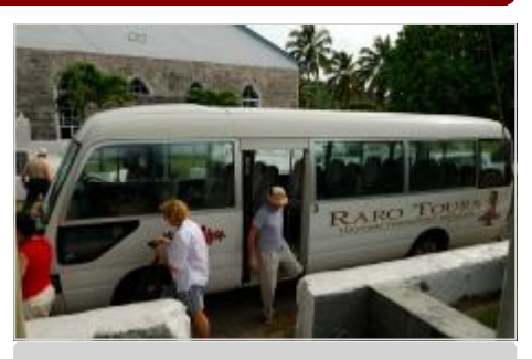
The Tour Bus

Knowledgeable Guides Your local tour guide has a great appreciation of the culture & heritage of Rarotonga. The commentary throughout the tour will provide you with the information you need to gain an insight into the structure of this small island community.