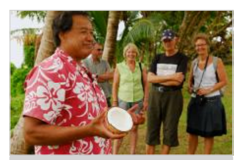
Coconut Husking Demonstration