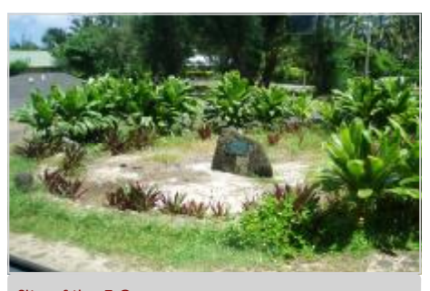
Site of the 7 Canoes